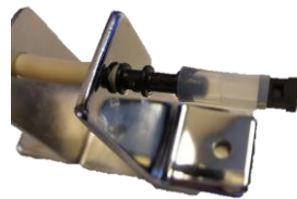
MT Fixture Tip, Stand