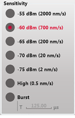
Figure 1. Sweep speed

The burst sensitivity is adapted to burst signals and dedicated to GPON measurements. The duty cycle must be in the range 2-100 % with a period between 124 and 2001 \mu s.