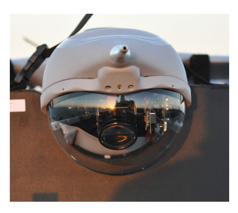
ScanEagle® is a product of Insitu Inc.